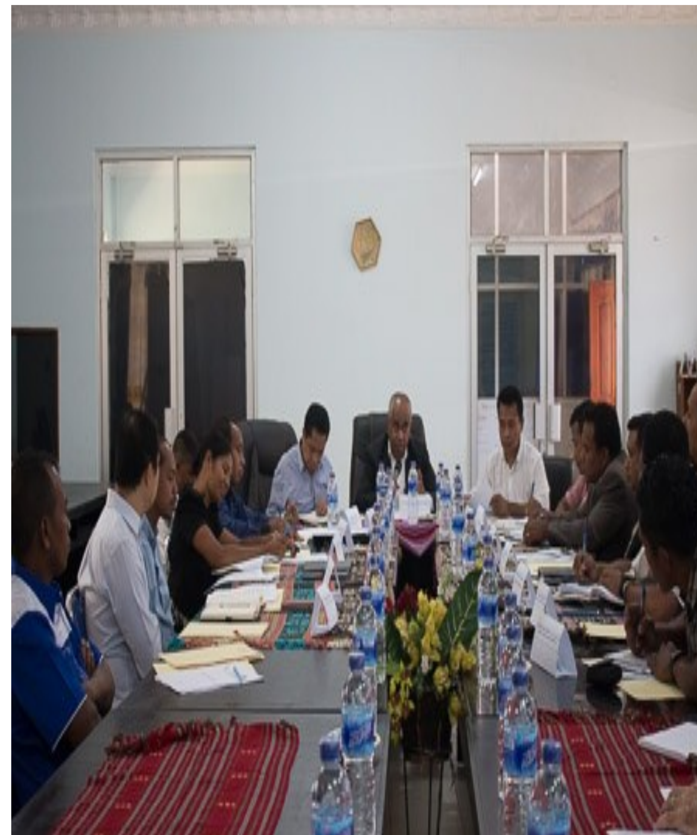
Membru Konsellu Fini Nasionál (Members of the National Seed Council)

Liu husi dirersaun no orientasaun husi Konsellu Fini Nasionál, MAP ho ekipa sistema fini munisipál implementa komponente sávi hirak tuir mai: