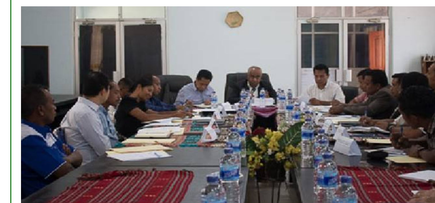
The Minister at the NSC meeting, September 2015

The National Seed Council is an advisory body providing advice and guidance to the Government on all matters related to the implementation of the National Seed Policy and all ensuing legislation and regulations, as well as support for national seed planning and development. The Council has representatives from all relevant stakeholders of the national seed sector.