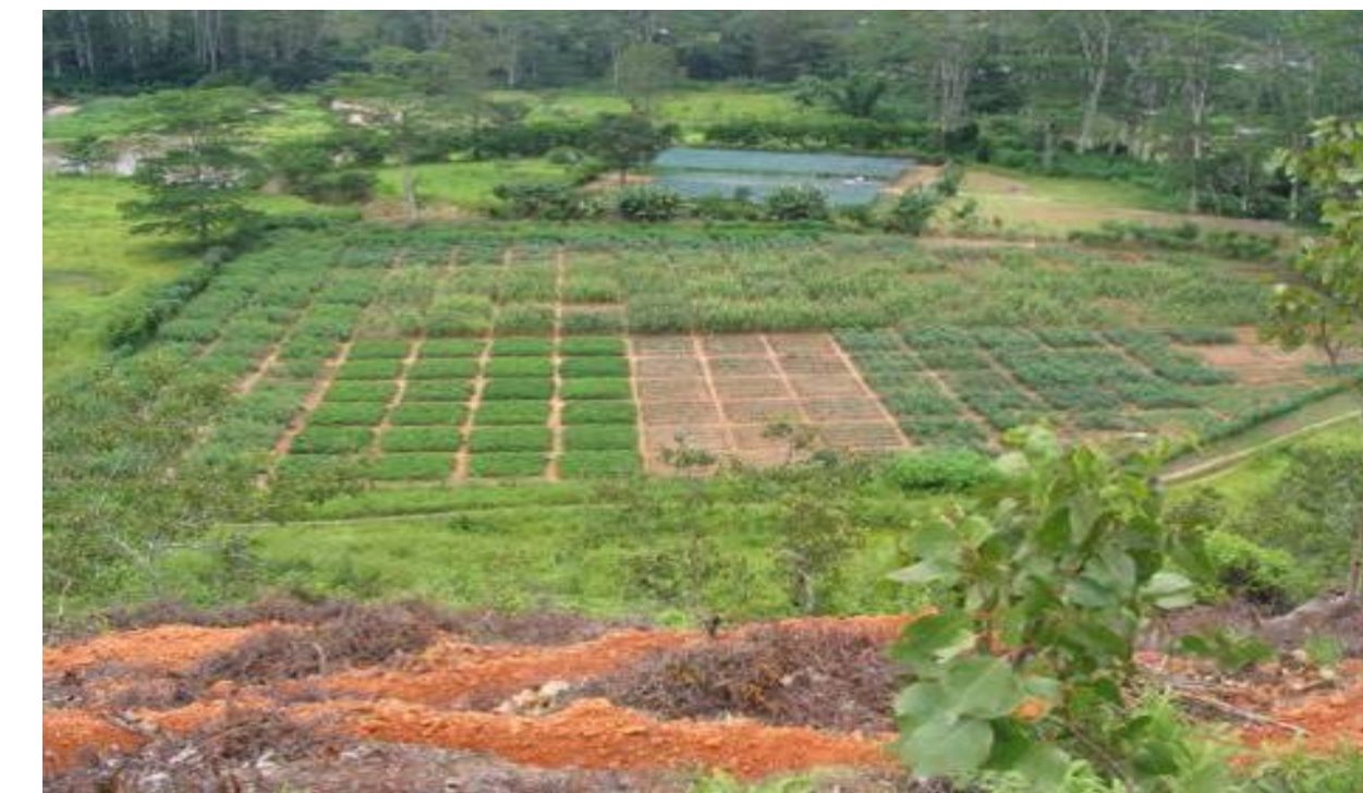
Quintal Portugal, Aileu