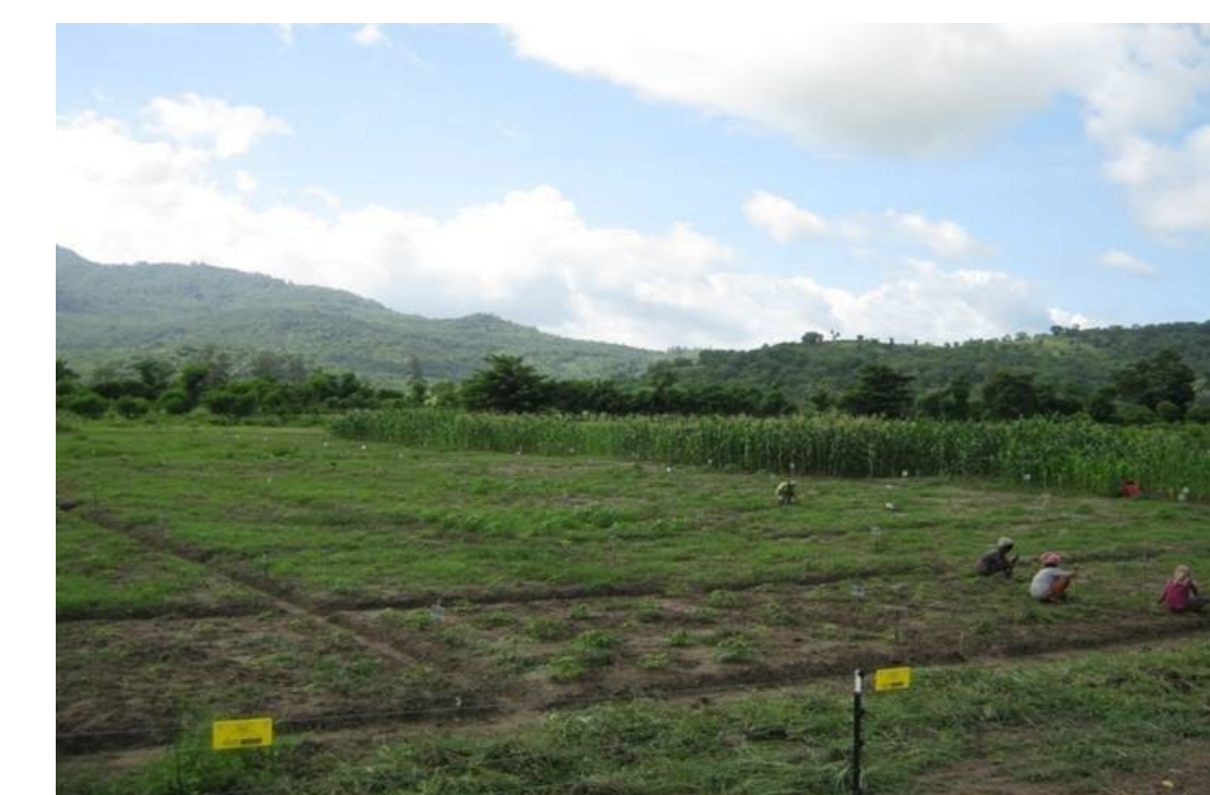
Loes Research Station, Liquiça