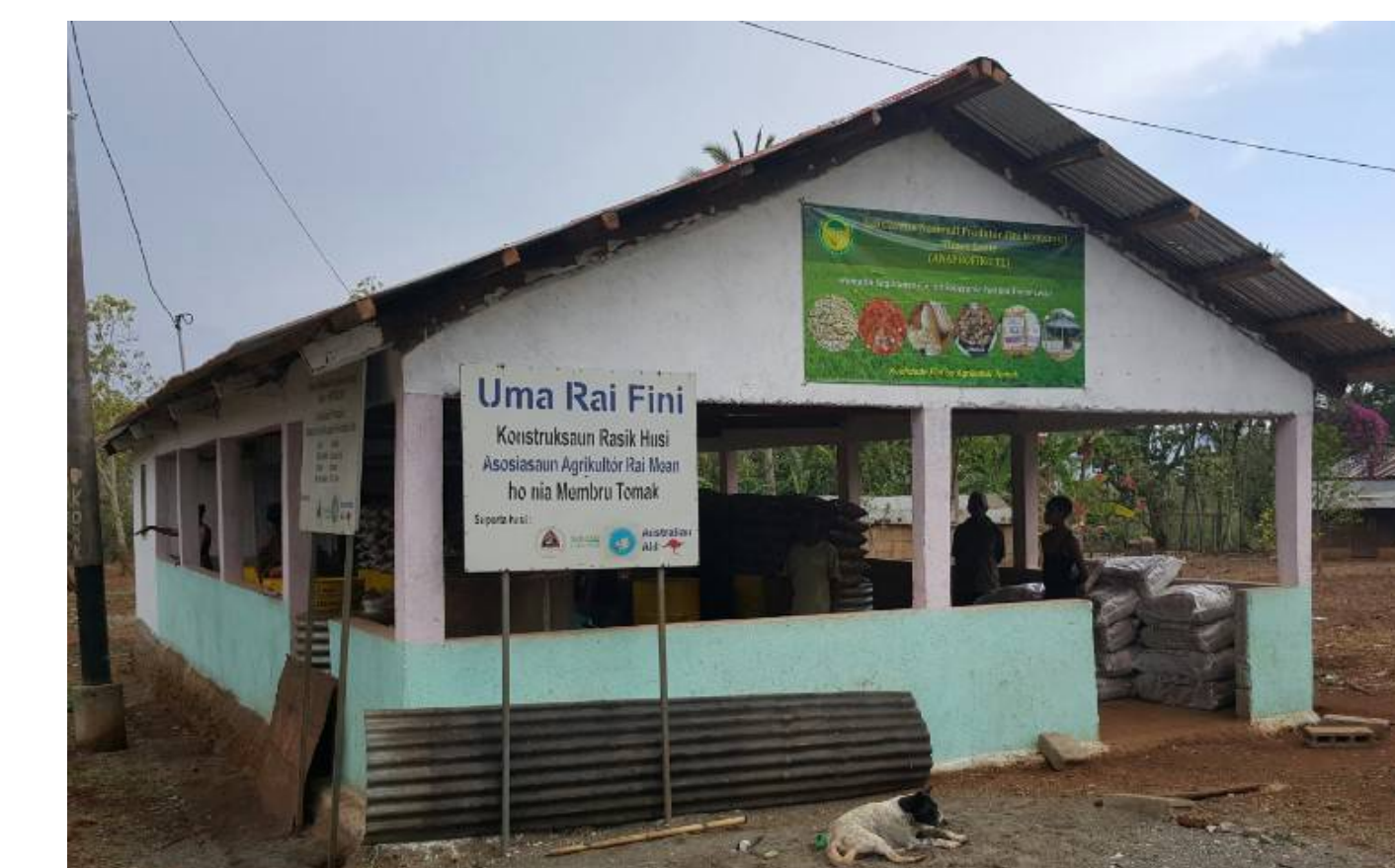
Community seed house of CSP Rai Mean, suco Gariuai, Baucau

65 Community Seed Houses ( Uma Rai Fini )