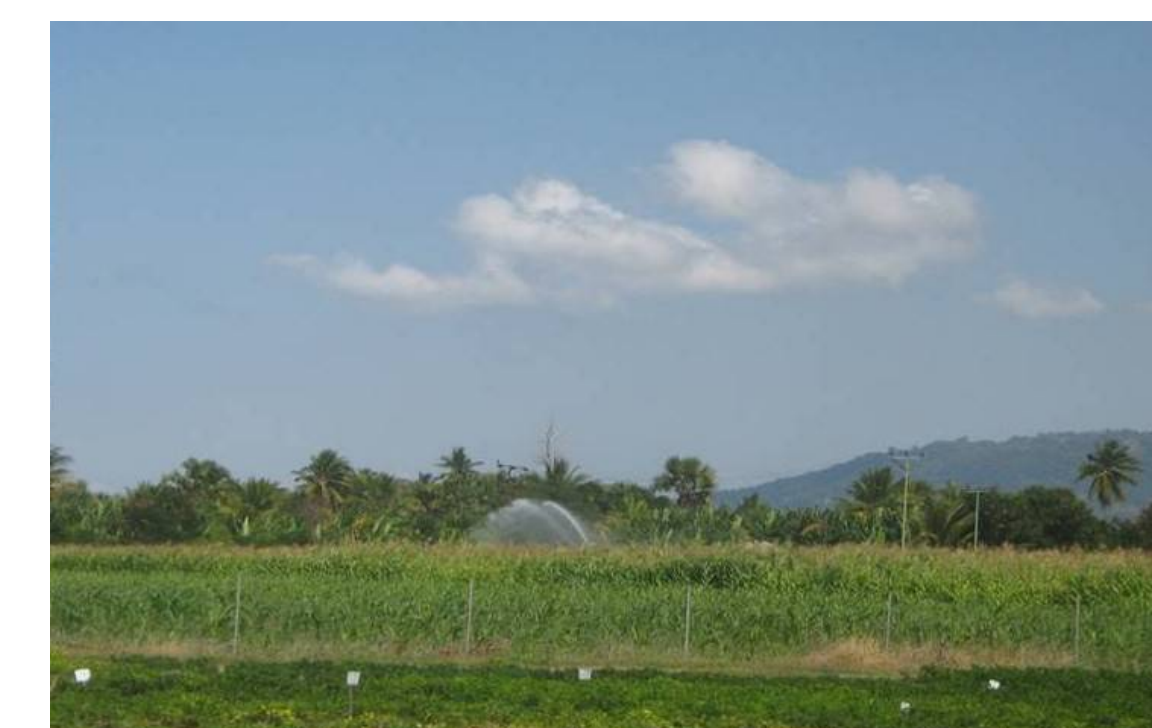
Betano Research Station, Manufahi