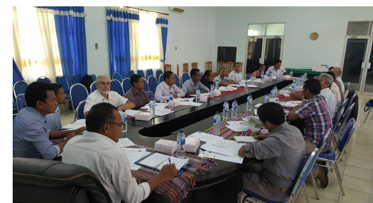
NSC meeting, April 2016