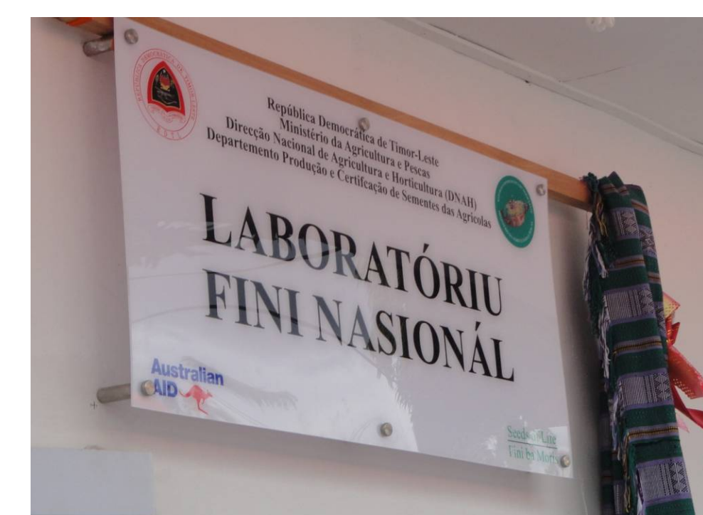
Seed laboratory, Dili

Three seed laboratories: Dili, Betano, Triloca