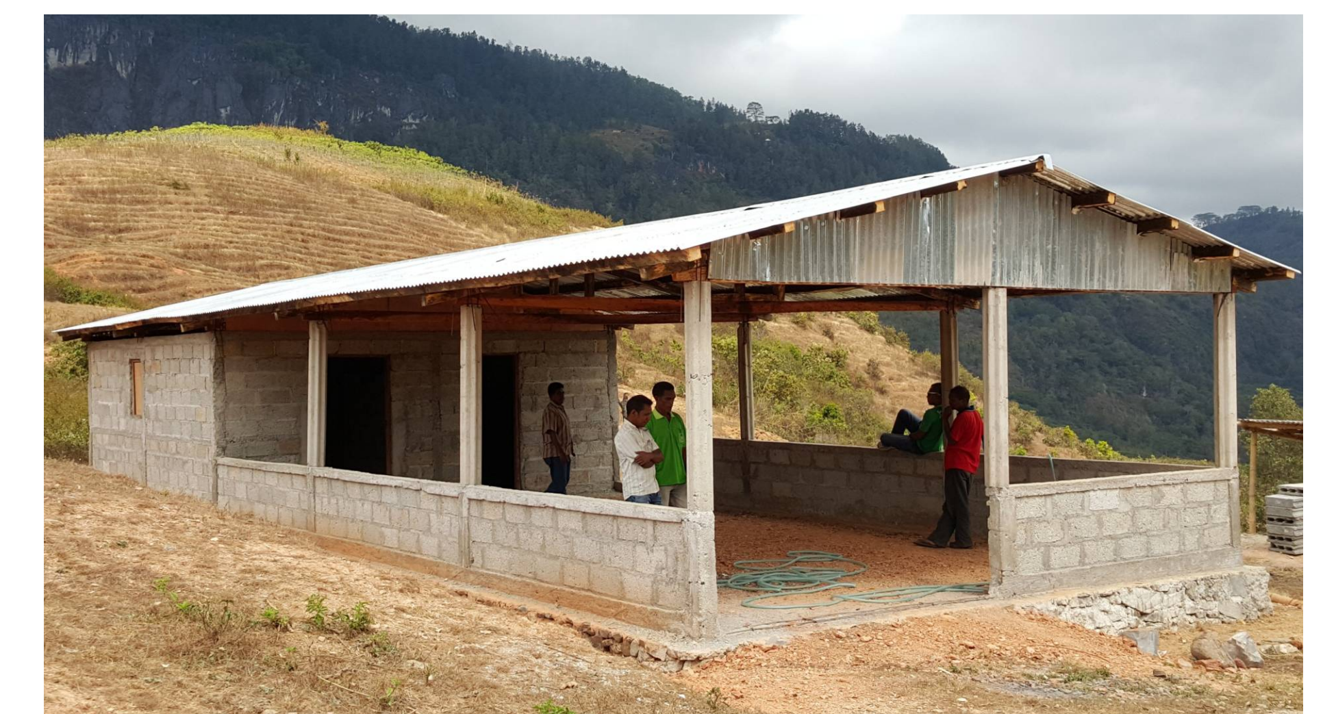
Community seed house of CSP Motaain Furak in suco Haupu, Ermera

Six seed warehouses, number of silos and their storage capacity (ton)