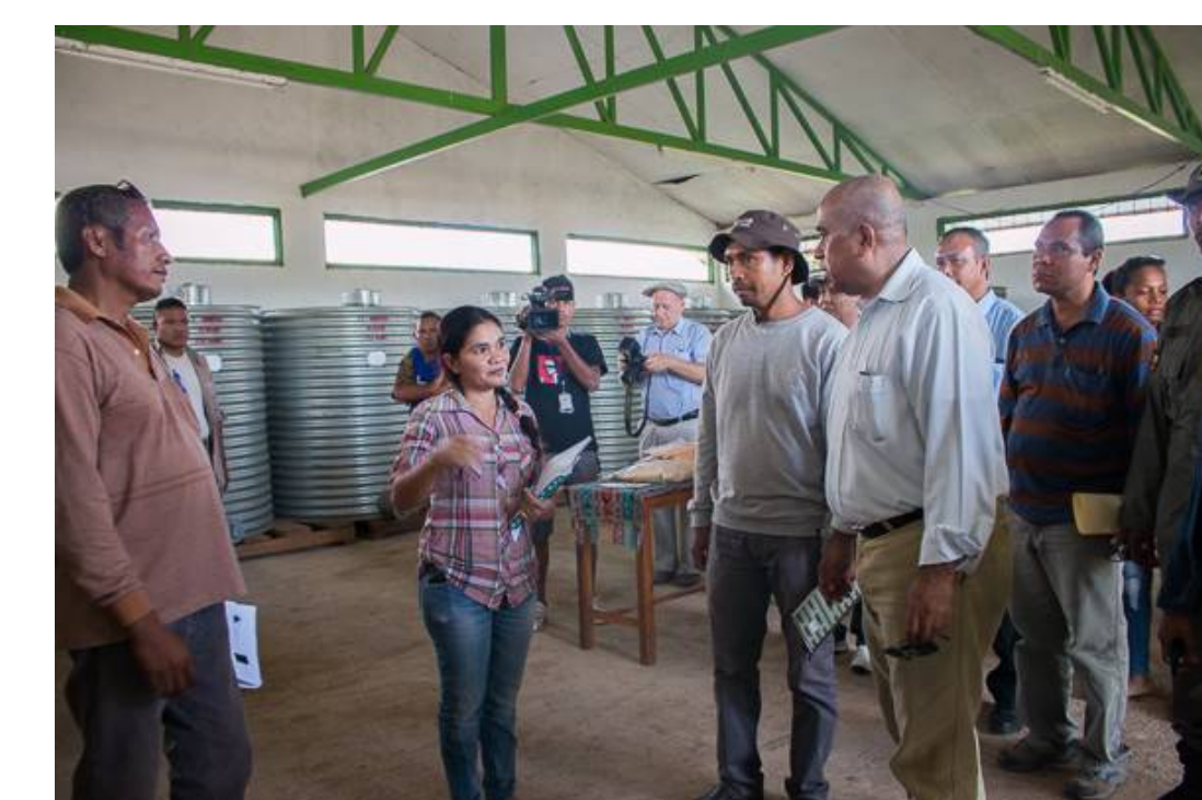
Visit by the Minister to the Corluli seed warehouse in Bobonaro