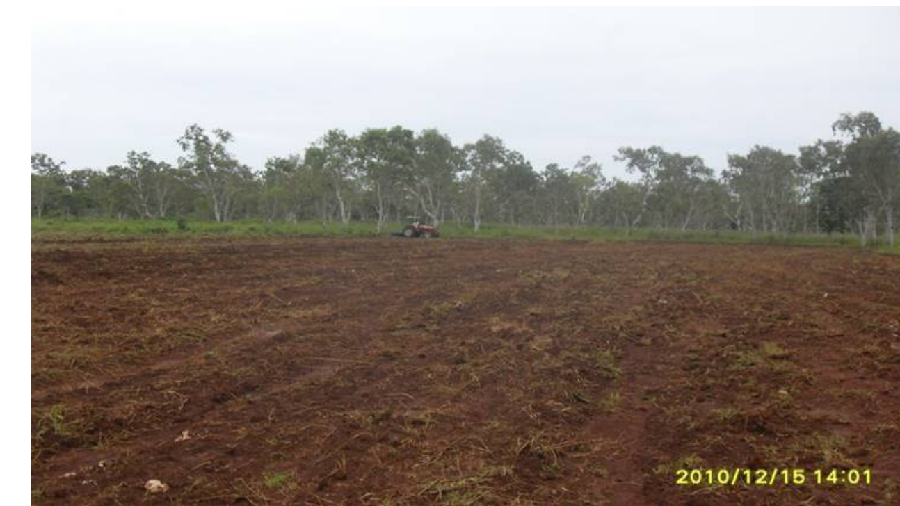
Darasula Research Station, Baucau