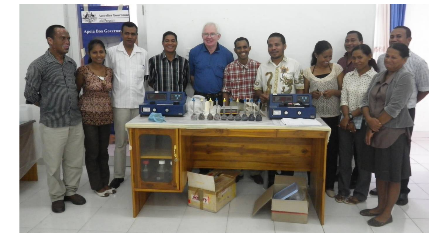
Training at the soil laboratory in Dili