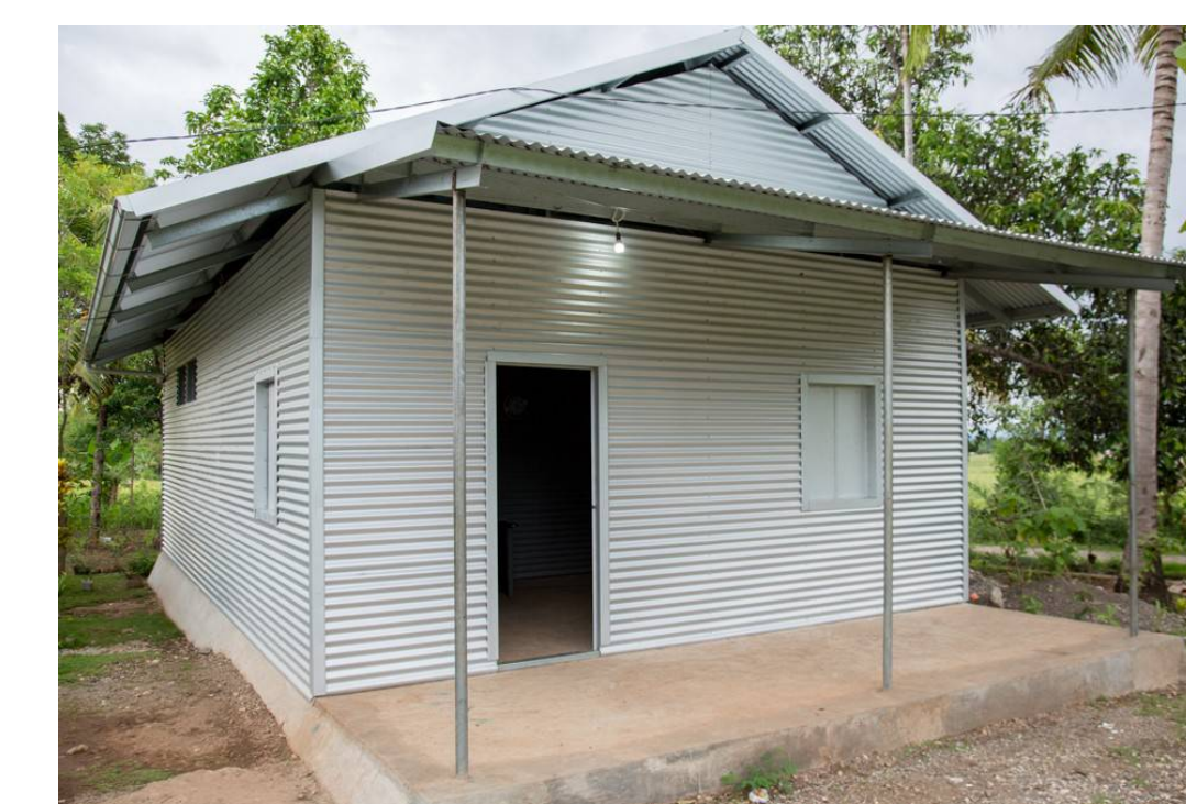
Seed warehouse in Raimaten, Bobonaro

Three seed laboratories: Dili, Betano, Triloca