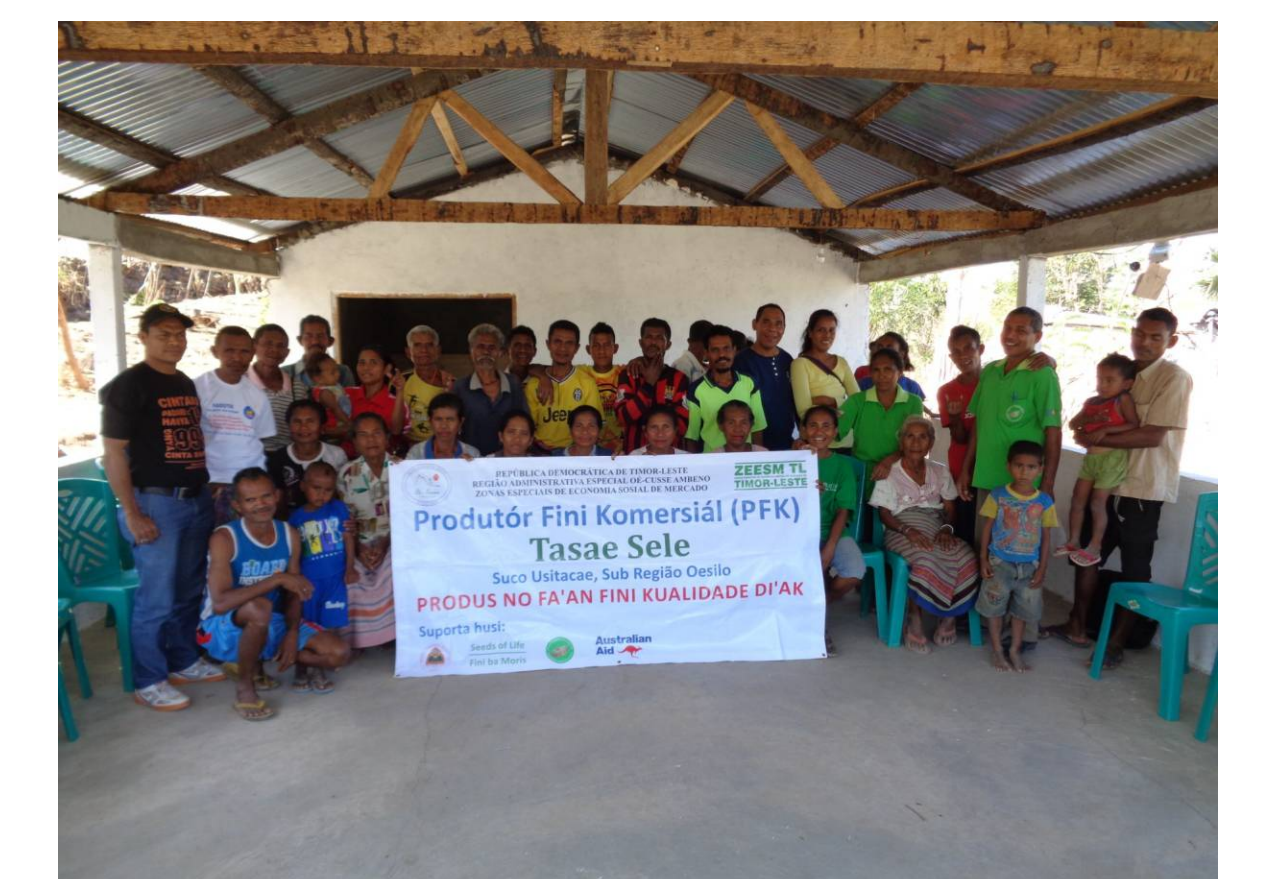
Community seed house of CSP Tasae Sele, suco Usitacae, Oecussi